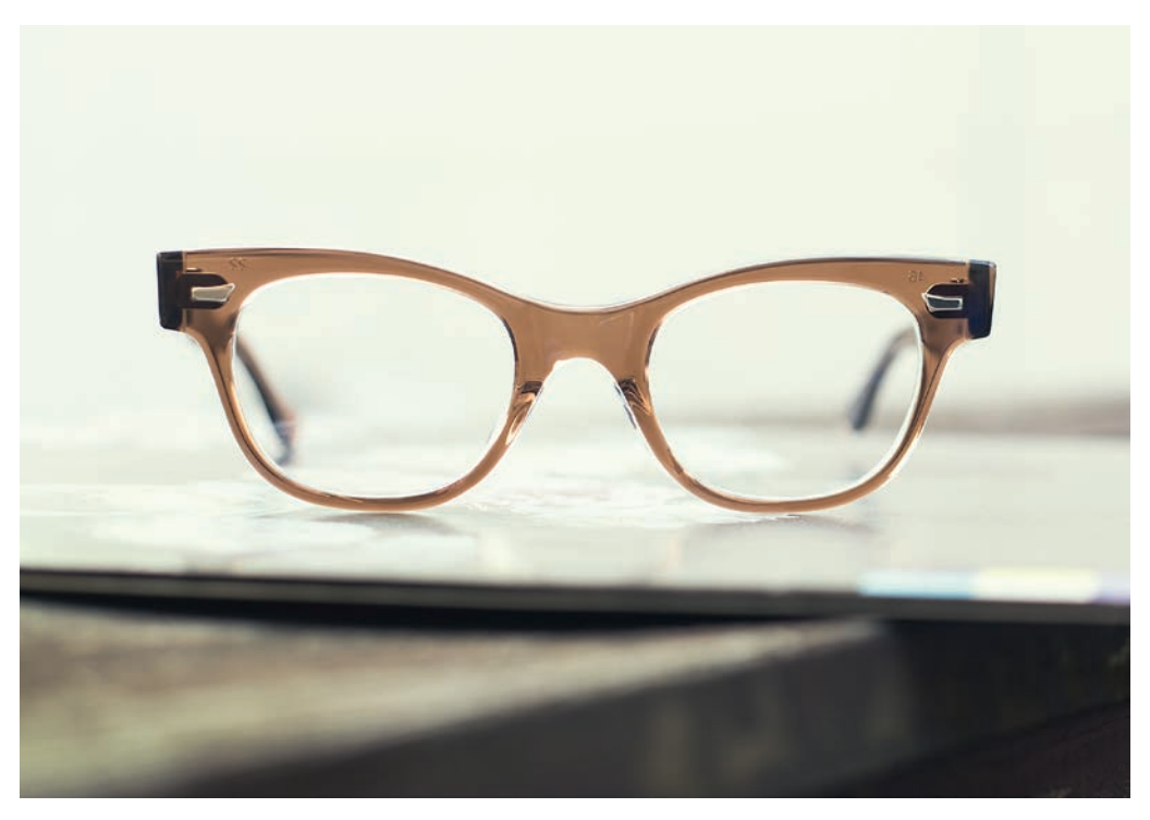
COUNTDOWN IN BROWN CRYSTALINE