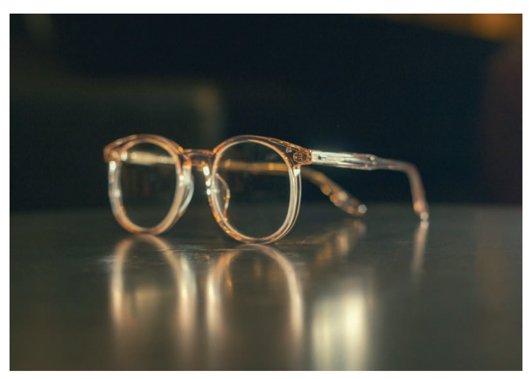
PRINCE X IN FRESH PINK CRYSTALINE