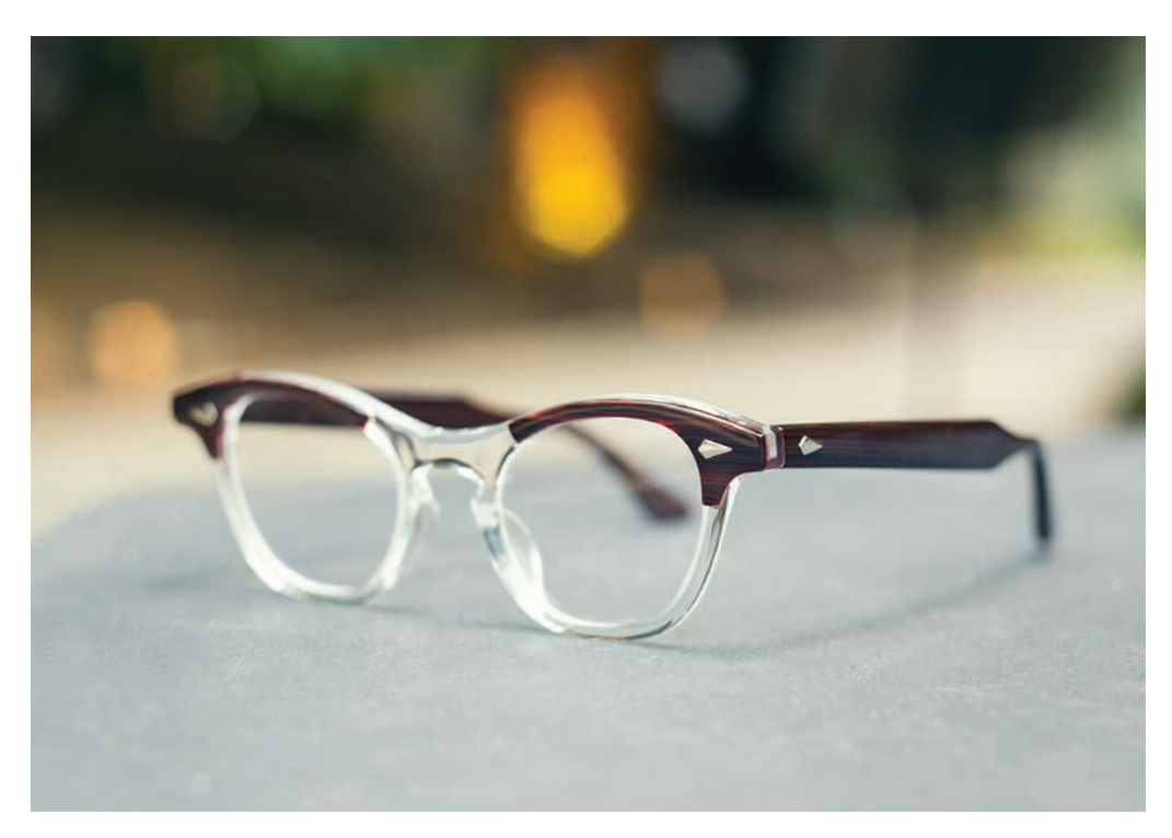
LEADING LIZ: BROW CONFIG. REDWOOD-CLEAR